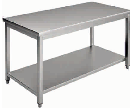
SS WORKING TABLE