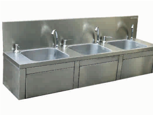
SS WASHING STATION