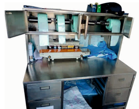
SS CONTROL & PACKAGING TABLE