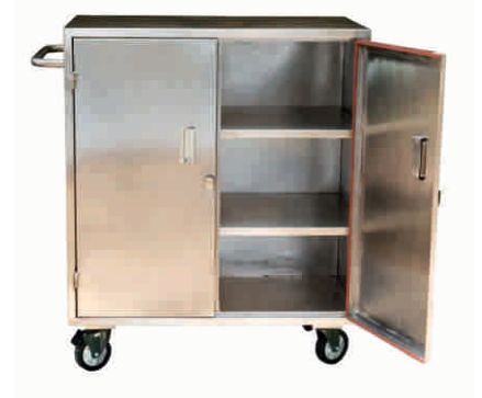
SS ENCLOSED DISTRIBUTION TROLLEY