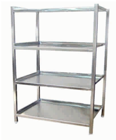
SS STORING RACK