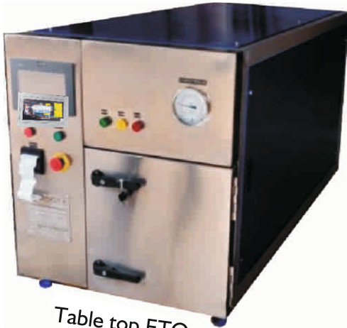
Table top ETO